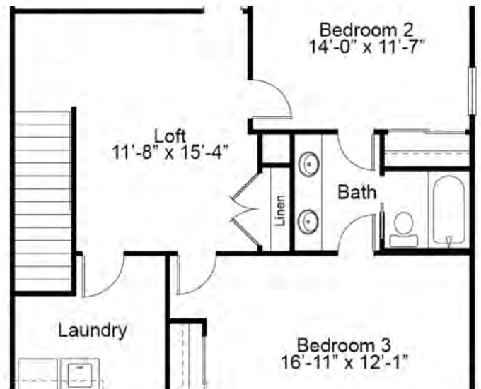
OPTIONAL SHARED HALL BATH